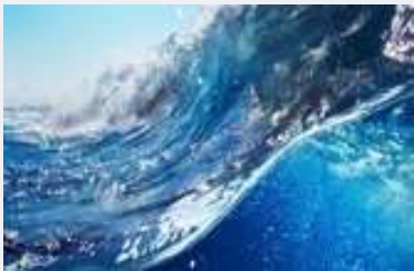
Section 4: Water Use