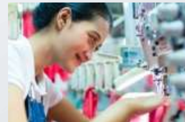
What to Expect On the Day of Your Higg FEM Verification