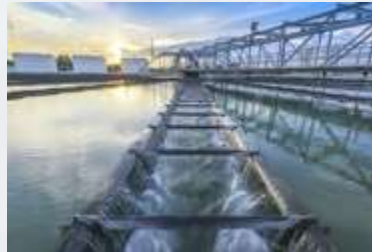
Section 5: Wastewater