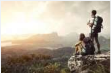
Section 3: Energy & GHG