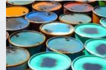
Section 8: Chemicals