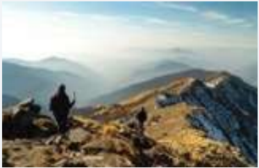
Sections 1 & 2: Site info & Permits and EMS