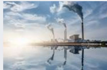
Section 6: Air Emissions