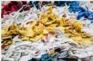
Section 7: Waste